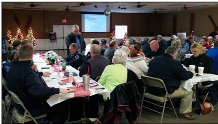
Participants of the NWS Winter Weather Workshop in Grand Rivers, KY