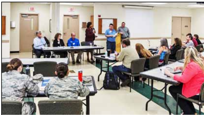
Panel discussion at the Hydrology Integrated Warning Team Workshop

Based on the feedback from participants and valuable engagement with partners, the NWS Tallahassee plans to continue similar workshops in the future.